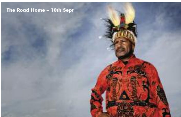
The Road Home – 10th Sept

Anna-Lisa Wickham 17 mins U Documentary that delves into the lives of three individuals that are forced to learn to cope with a void which stemmed from having to live without a person of significance. Documentary. Trinidad And Tobago