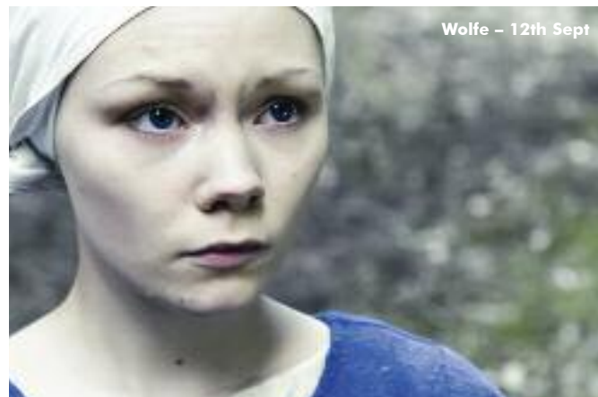
Wolfe – 12th Sept

London: A Love Story Susanna Hellden 30 mins A musical celebration of the hustle and bustle on the streets of London. Documentary