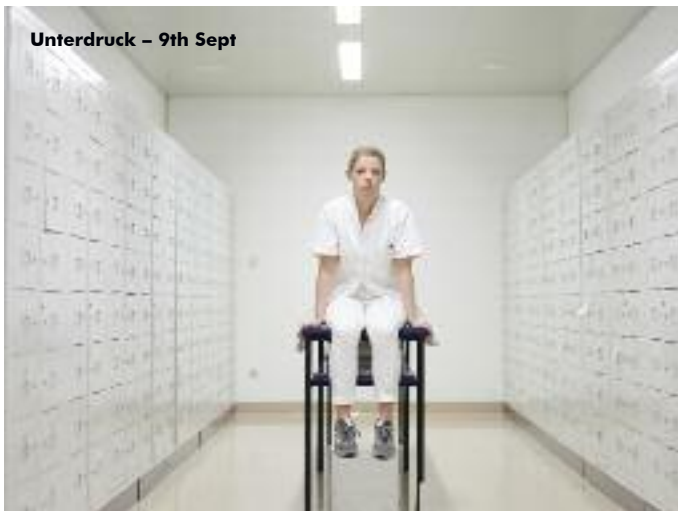
Unterdruck – 9th Sept

'Hidden Herstories, women of change' unveils how the achievements of Octavia Hill and Jayaben Desai had significant international impact on the issues of race, gender and trade union relations and social poverty. Octavia Hill was a pioneer in social housing and one of the founders of the National Trust and Jayaben Desai, who made unprecedented advancements for workers' rights, led the famous Grunwick strike.