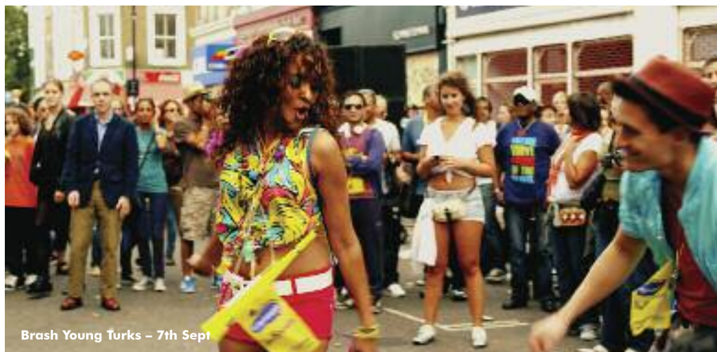
Brash Young Turks – 7th Sept