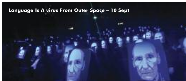
Language Is A virus From Outer Space – 10 Sept

Cara Aparicio Yoldi 3 mins Abstract movements based on Van Gogh's painting. Art