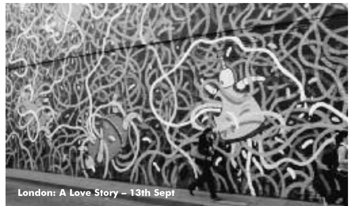
London: A Love Story – 13th Sept

Food, First Pol Ponsarnau 11 mins 12A Food first, then morals! Comedy about two couples in a stylish Berlin Tapas restaurant. Tension grows with each dish. All seems lost when the question "who waters your plants?" comes on the table. Drama. Germany